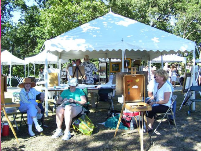
Pastel Society booth at Arts in Bloom, Wellfield Botanical Gardens, Aug. 28.