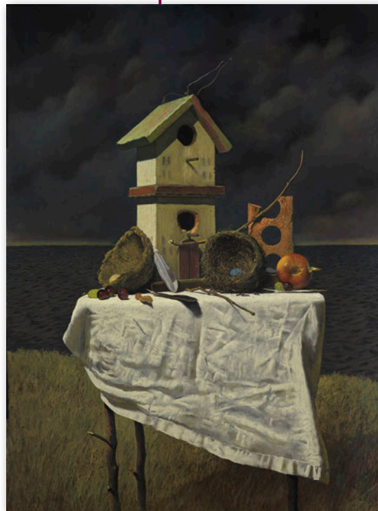
House By the Lake by Ronald Monsma

I often add top layers of color using soft pastels, doing much of the blending by dragging one color into another until the right color and saturation is achieved."