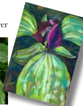
Inspiration from the wild flower hike. Photo and pastel by Mary Firtl