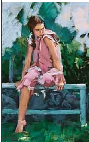
Figure workshop in Ann Arbor