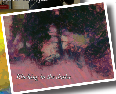
Blocking in the darks.